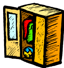
table - chest - television set - rocking chair - cupboard - bed - sofa - desk - lamp - chair - bookshelf - baby crib